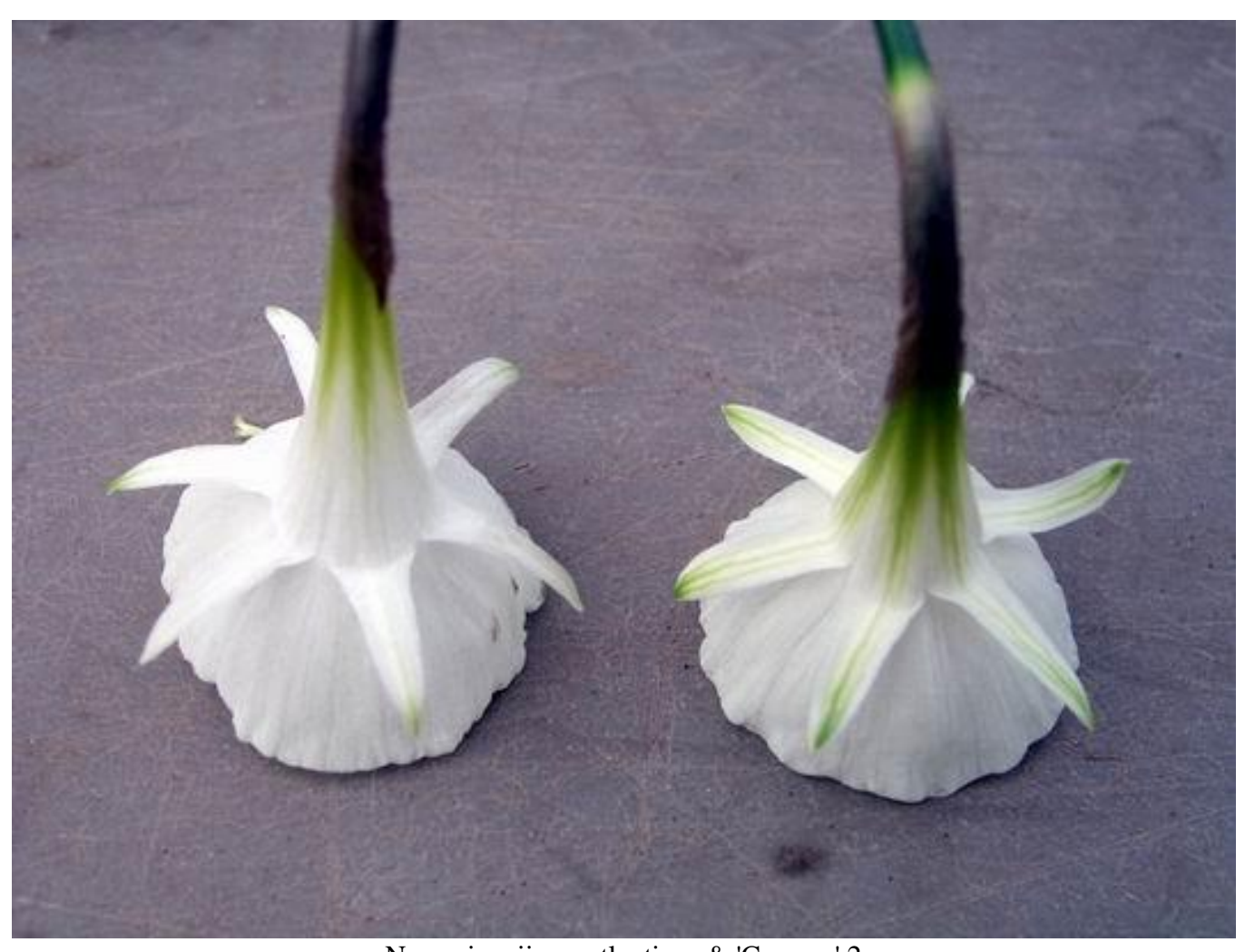
N. romieuxii mesatlanticus & 'Camoro' 2 Again 'mesatlanticus' is on the left and 'Camoro' is on the right.