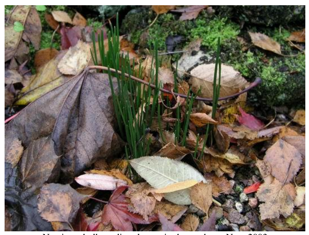
Narcissus bulbocodium leaves in the garden - Nov. 2003

If we have a (normal) wet summer the new leaves can start to appear before the old leaves have died back completely.